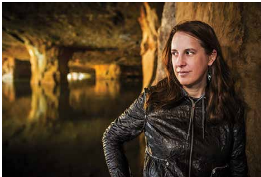
photo of the author in the Widow Jane Mine at Century House